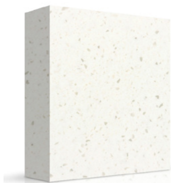
Blanca Pro 701Z