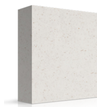
Jasmine Pro 532Z