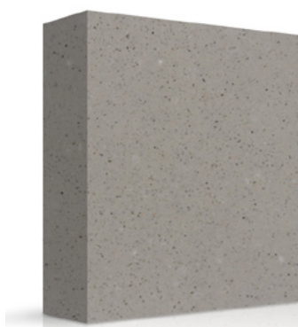
Smokey Mountain Pro 520Z