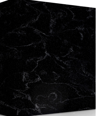
M002 Mt. Vancouver

An attractive material, also capable of maintaining strict hygiene standards, was needed for this high traffic kitchen space. Meganite's non-porous properties enhance the hygiene of the space and make daily maintenance easy, making it the perfect option for any area that comes into contact with food. Meganite is certified by the NSF for food safe contact. The non-porous feature also limits mold, mildew and bacteria growth in spaces with high water contact, especially around the sink areas.