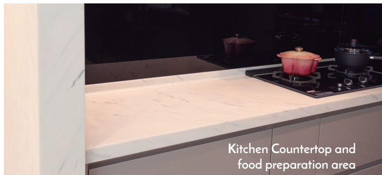
Kitchen Countertop and food preparation area